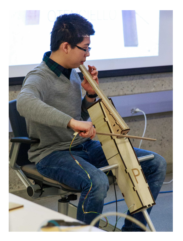
Figure 3 . Student playing his Potenciello during his final performance, we can distinguish the main part of the instrument, the neck supporting the two SoftPot membrane potentiometer, the body housing the electronics and the motor, and the bow whose frog contains pressure sensor and accelerometer.

positions on two SoftPot membrane potentiometers by mapping the readout of voltage dividers.