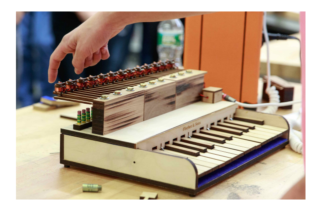
Figure 2. Fischer and Sons, a keyboard inspired by the Fender-Rhodes piano

• Fischer & Sons , a keyboard inspired by the Fender-Rhodes piano, using the relay coils to pick up the oscillation of magnets fixed at the ends of wooden tines (as shown on fig.2);