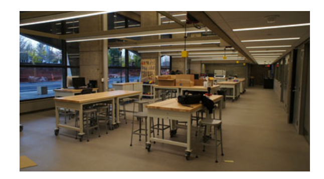
Figure 1. The studio at the Yale Center for Engineering, Innovation and Design

Yale's Center for Engineering Innovation & Design (CEID) opened in the fall of 2012; it centralizes and expands the resources previously available to engineering students.